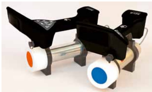
Color coded end caps for immediate recognition of detector type

All spectra are stored on a removable compact flash disc - time and date stamped. Thus processing and transmitting those files for further analysis is very easy.