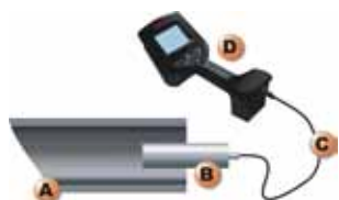
2 hand measurement application

One or two hand operation is possible for the best ergonomics for each monitoring situation. The probe can be easily detached by the operation of a single clip: